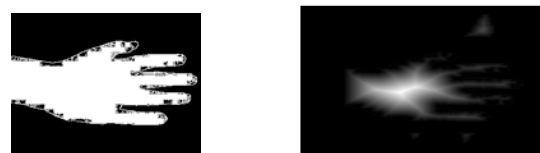
Fig. 1 Input Image Fig. 2 ED Transform

Below images show the Euclidean distance (ED) transform as computed in matlab: